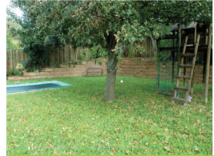
Space for a trampoline and jungel gym

curves, steps and terraces; details that are difficult and costly to construct when using more conventional, in-situ concrete retaining systems. In addition, the blocks are completely reversible, allowing for a round or flat face finish, with an additional rock face option.