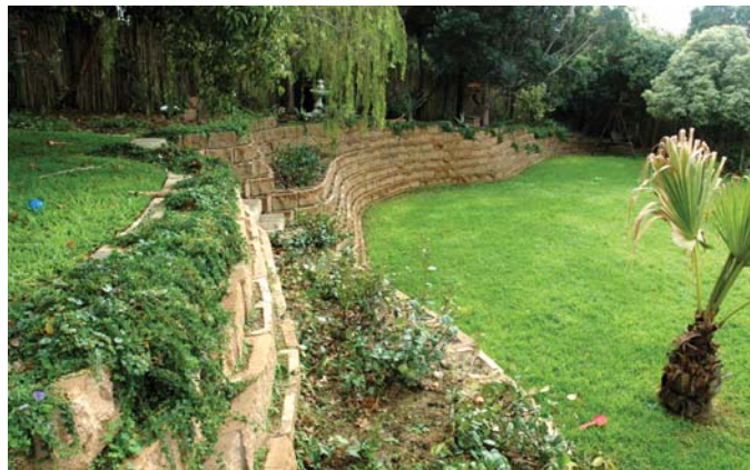
Plant pokets and creepers add a soft feel

In South Africa, the Terraforce Retaining System represents one of the most versatile products available. It allows the scheme designer to incorporate features such as