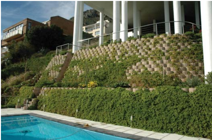
Three Terraforce walls transformed this steep gound into usable space.

To reclaim the land, as a valuable asset, it was decided to provide three level terraces, connected by formal and informal stairways. The terraces were installed with the Terraforce L11 block, with a round face finish, and the Terraforce 4x4 Step Block was installed for the stairways linking each level.