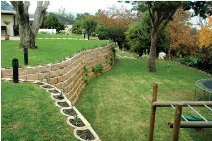
The Terraforce walls at this home in Somerset West created lots of play space.

usable space, landscaping contractor Magda Kirkham proposed two curved, undulating Terraforce walls that shape the garden into several levels of lush green grass connected by four sets of stairways constructed with the 4x4 Step block.