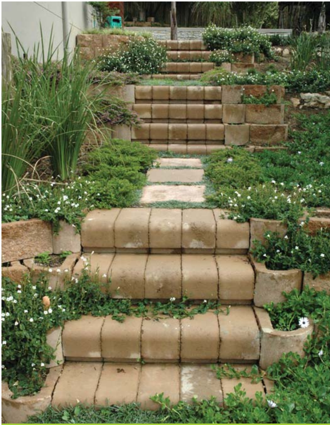
Access steps along the side of the house with soft plant cover.

levelled sections in his garden, creating usable play and entertainment areas for his family.