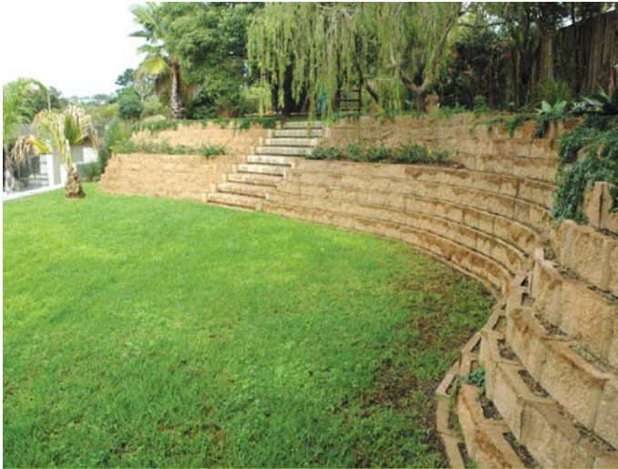
A gently curving retaining wall creates plenty play space for this home in Welgemoed, Western Cape.