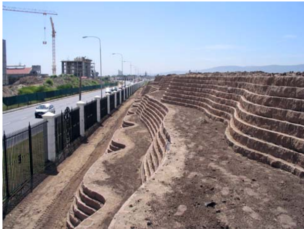
The installation nearing completion